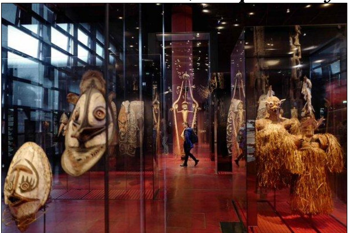
Objects on display in Paris at the Quai Branly Museum, which has 70,000 pieces from sub-Saharan Africa.