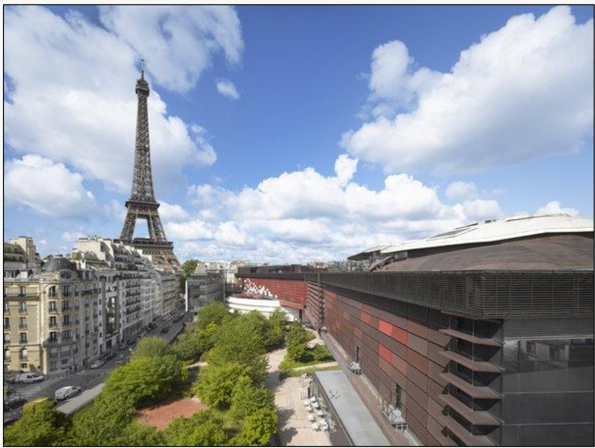
The exterior of the Quai Branly Museum.

Elsewhere in Europe, museums will be closely watching the fallout from the report, which could increase pressure on them to return objects from their own collections. The British Museum in London has some 700 objects from the Kingdom of Benin, whose territory is now part of Nigeria. Berlin is hoping to fill its new Humboldt Forum museum with several hundred sculptures from the same kingdom and known as the Benin Bronzes.