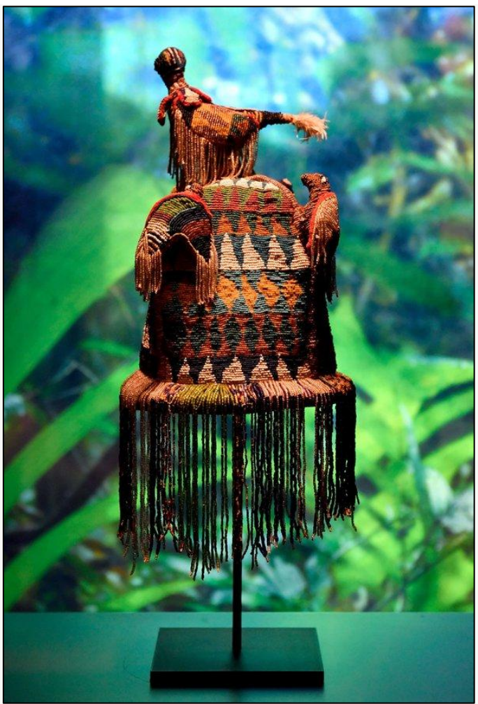
A late-19th-century funerary crown from the Kingdom of Dahomey on display at the Quai Branly Museum. The kingdom was in what is now Benin, which has asked for the restitution of its national treasures from the museum.

"This is a discussion that has to take place between arts professionals and academics," she said. "Otherwise, there will be a politicization of restitution."